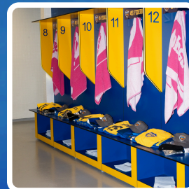
PROFESSIONAL LOCKER ROOM