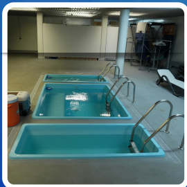
CONTRAST HYDROTHERAPY POOLS