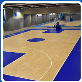
SALA CLUB GRAN CANARIA ARENA